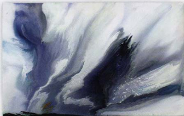
What Water Dreams II acrylic/panel 60" x 96"