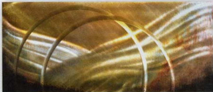
Fusion patina/bronze panel 20" x 44"